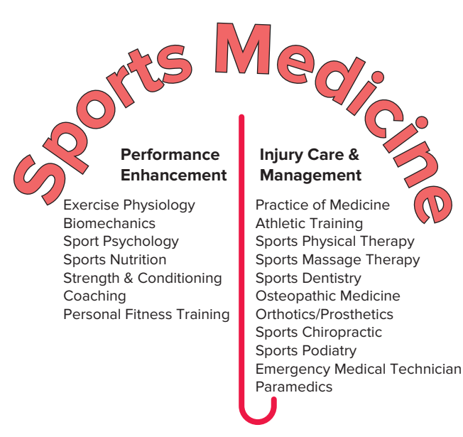
FIGURE 1–2 Areas of specialization under the sports medicine "umbrella."

emergency medical technology. The American College of Sports Medicine (ACSM) has defined sports medicine as multidisciplinary, including the physiological, biomechanical, psychological, and pathological phenomena associated with exercise and sports.<sup>3</sup> The clinical application of the work of these disciplines is performed to improve and maintain an individual's functional capacities for physical labor, exercise, and sports. Sports medicine also includes the prevention and treatment of diseases and injuries related to exercise and sports.